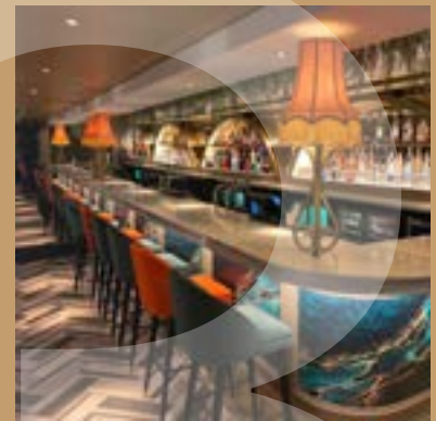
IBERIAN LIGHTING 02/2023